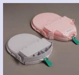
Pad-Pak™ and Pediatric-Pak™, with pre-attached electrodes

Low cost of ownership. Cartridge typically has a shelf-life of 3.5 years from date of manufacture, offering significant savings over other defibrillators that require separate battery and pad units.